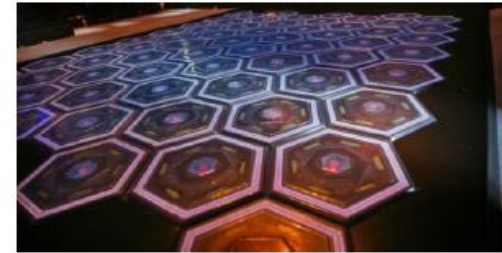
Grid of stones